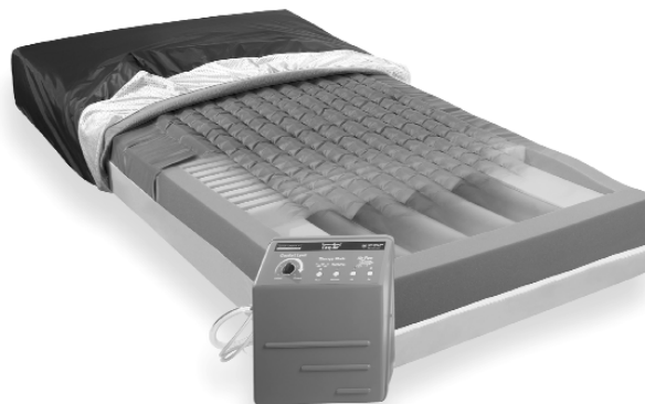
Fig. 2 – Geo-Matt cut foam layer with Air Diffusion Matrix prevents patient cooling

2. Air flow blocked by compressed fabric For maximum effectiveness, moisture removal should be occurring beneath the entire surface of the top coverlet. But in typical low air loss systems, this cannot happen. Such systems rely on polyester batting to create a lofting layer between the top fabric and the air escaping from the cylinders below. In theory, this lofting layer holds moisture vapor—which has passed downward from the patient through the top fabric—until rising air can carry it out of the system. However, the polyester lofting material is compressed under the user's weight. This allows the top fabric to lie directly on the perforations in the cylinders below, effectively closing them off. Moisture removal can then only occur around the periphery of the user, not directly under him, greatly decreasing the amount of moisture the system can remove. Systems that use no lofting material at all have the same problem.