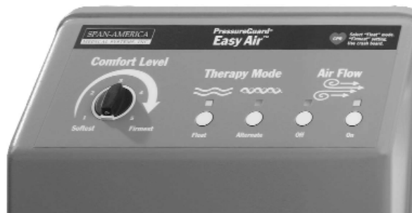
Fig. 5 – Simple controls for PressureGuard Easy Air

8. Gatching negatively affects performance. Computerized pressure mapping of typical systems reveal significantly higher pressures in the sacrum when the head of the bed is elevated. To address this, some systems require use of special "Fowler Boost" or "Seat Inflate" settings to keep the user from bottoming out in this position. Others simply do not address it.