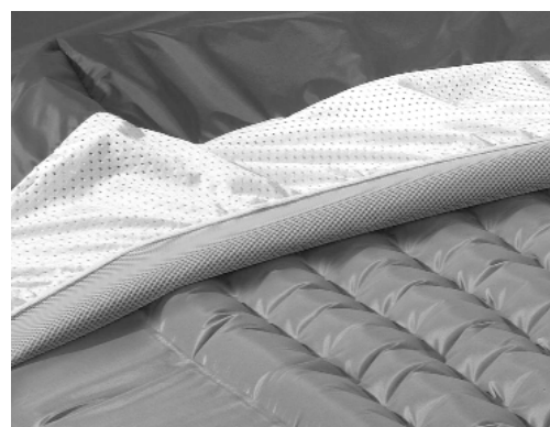
Fig. 3 – Air Diffusion Matrix fabric with air-flow cover

Easy Air solution: Un-compressable "Air Diffusion Matrix" fabric. Easy Air uses a proprietary, three-dimensionally woven fabric that will not completely compress beneath a user's weight. (See Fig. 3) This fabric is used in both the top coverlet and in the air-flow cover of the mattress itself to ensure an uninterrupted path for air flow directly beneath the user. This tremendously increases the Easy Air's capacity to remove excess moisture, especially from areas like the sacrum that typical LAL systems fail to address.